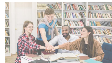
Translang²-Projektbüro Center for Teacher Education and Educational Research (CeLeB) University of Hildesheim translang@uni-hildesheim.de