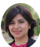
Latin America Coordinator Liasion Office UAEM Toluca

Mail: intkult@uni-hildesheim.de Tel.: 0049-5121-883-92018